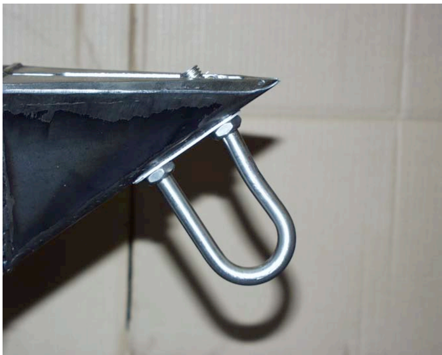
Fig. 4 - Bent bow eye after loading and contact with the SNAPPER mounting plate.