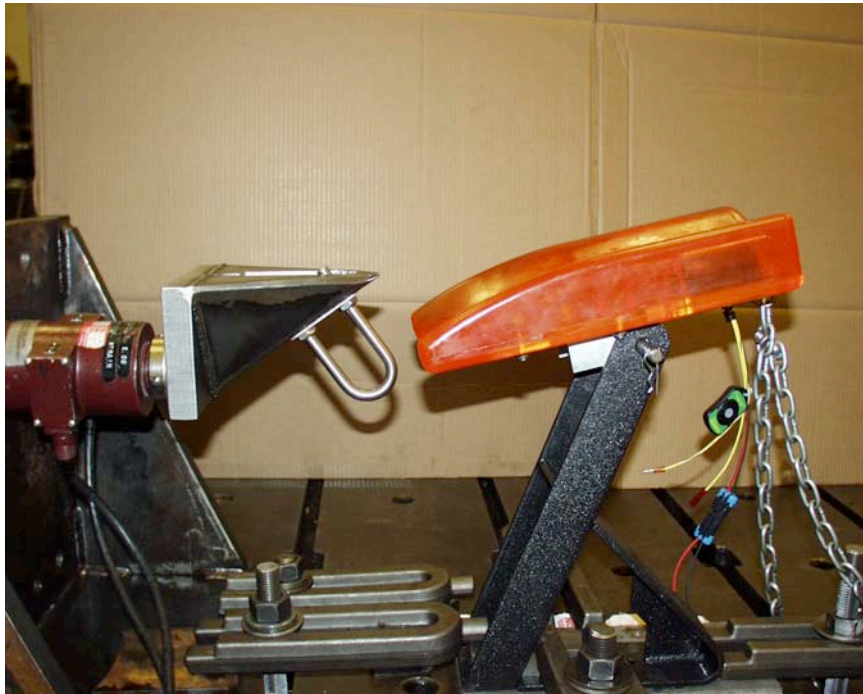
Fig. 1 - Overall side view of test setup.