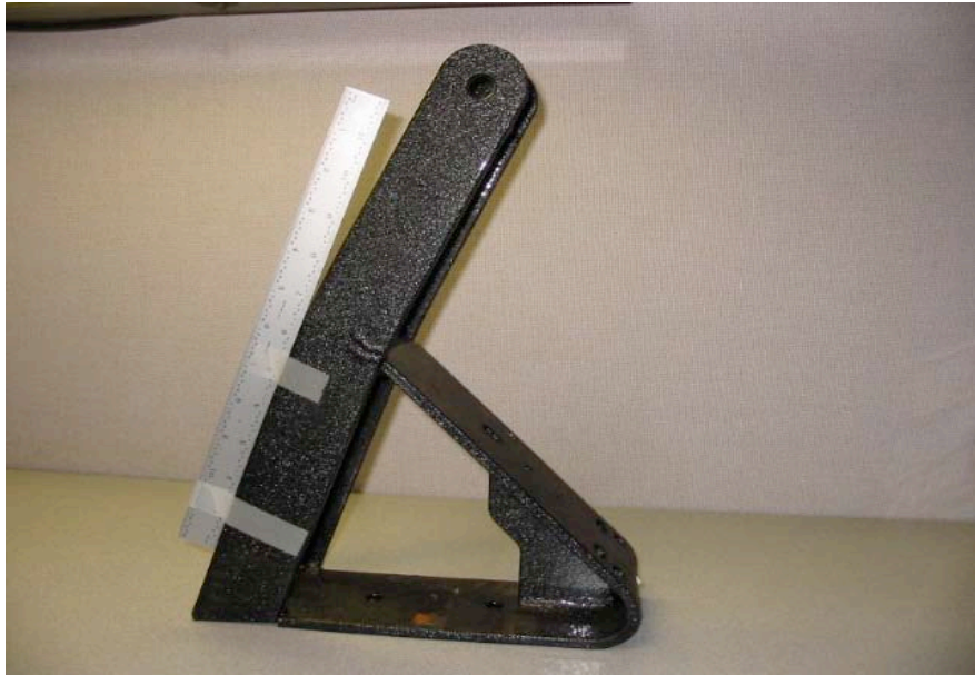
Fig. 7 - Bent winch stand upright supports after loading.