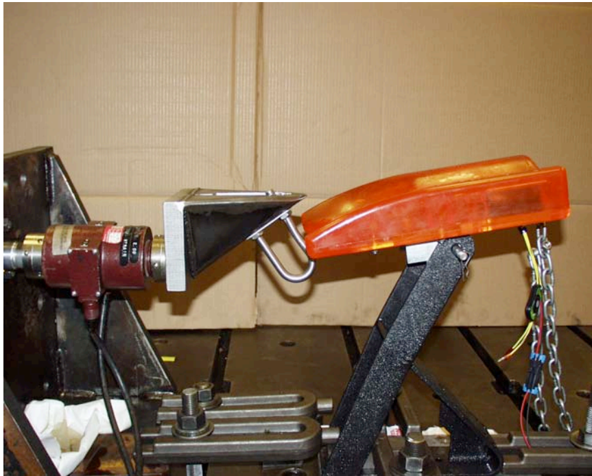
Fig. 3 - Overall view of bent bow eye after loading and contact with the SNAPPER mounting plate.