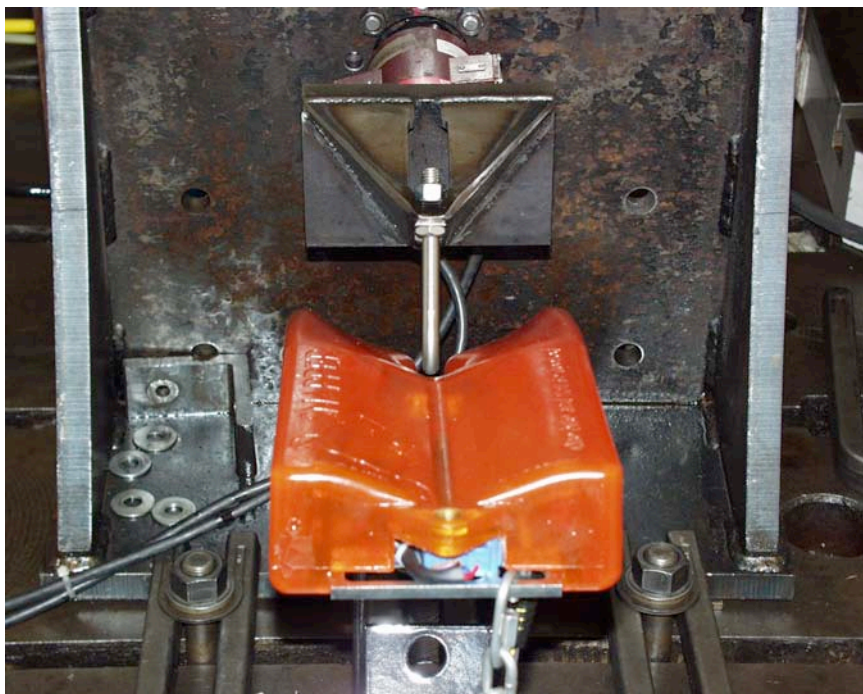
Fig. 2 - Overall Front view of test setup.